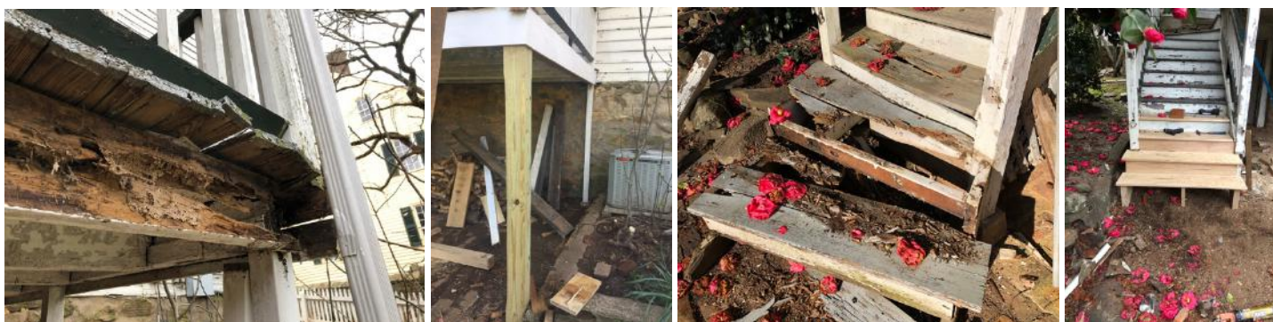
(left to right) Blum House rear porch structure deterioration; Stair rot; Repaired stair; Repaired porch structure.