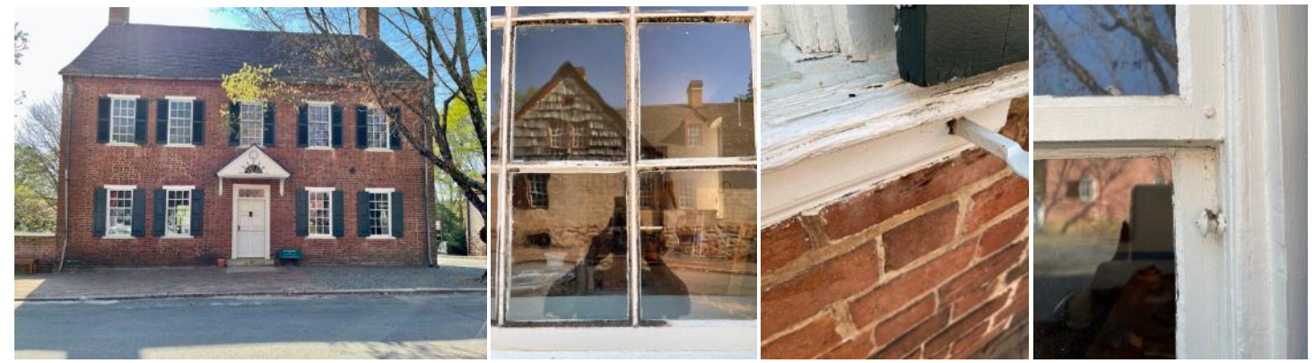
(left to right ) Vogler House is set to get all of its windows and doors restored. We made public an RFP process to chose a contractor to facilitate this work. As part of our EQUITY INITIATIVE, we are expanding our outside vendor list. The goal of this Vogler RFP is to restore the windows to operability.