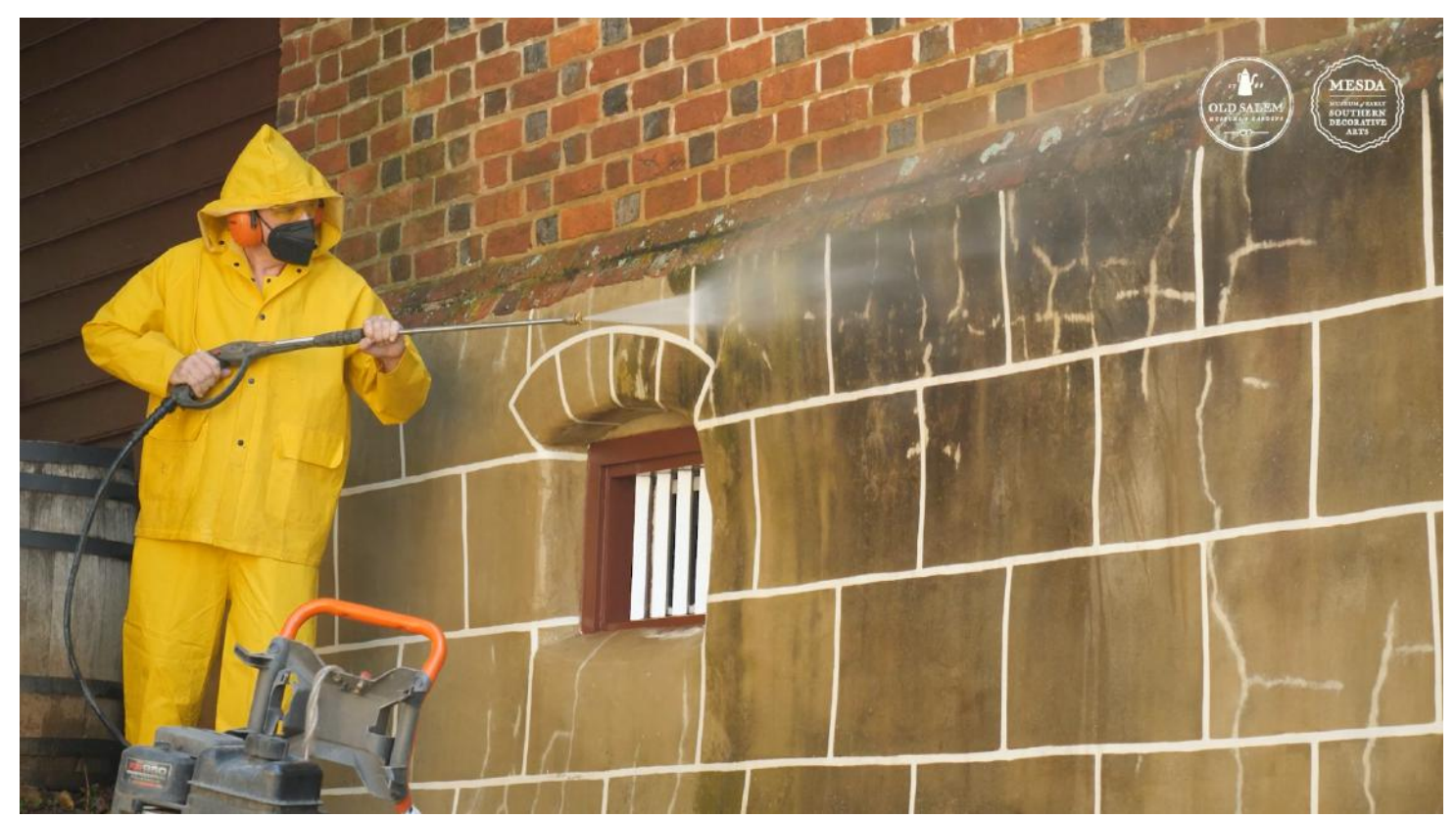
Winkler\ bakery\ gents\ a\ gentle\ pressure\ washing\ to\ remove\ the\ algae\ and\ mildew.