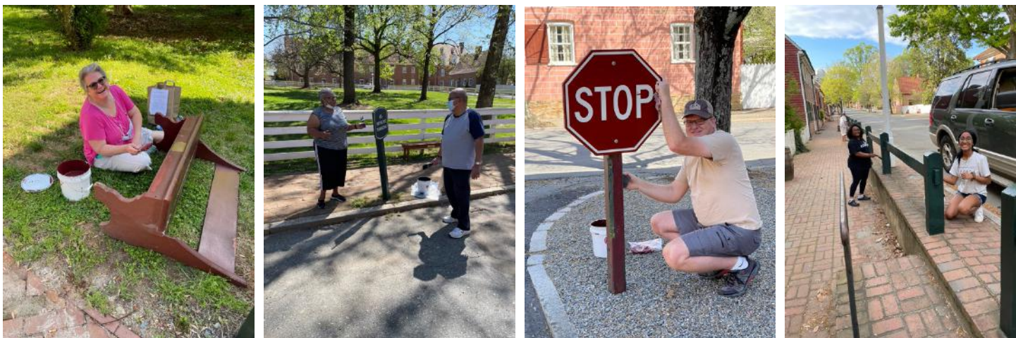
(left to right) Members of the Old Salem and Museum of Early Southern Decorative Arts team grab a paintbrush, and help make everything look great!