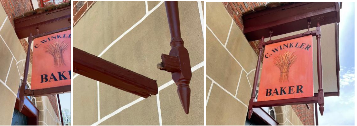
(left to right) The Winkler Bakery sign needed rebuilding. Following the removal and restoration, it now hangs beautifully repainted.