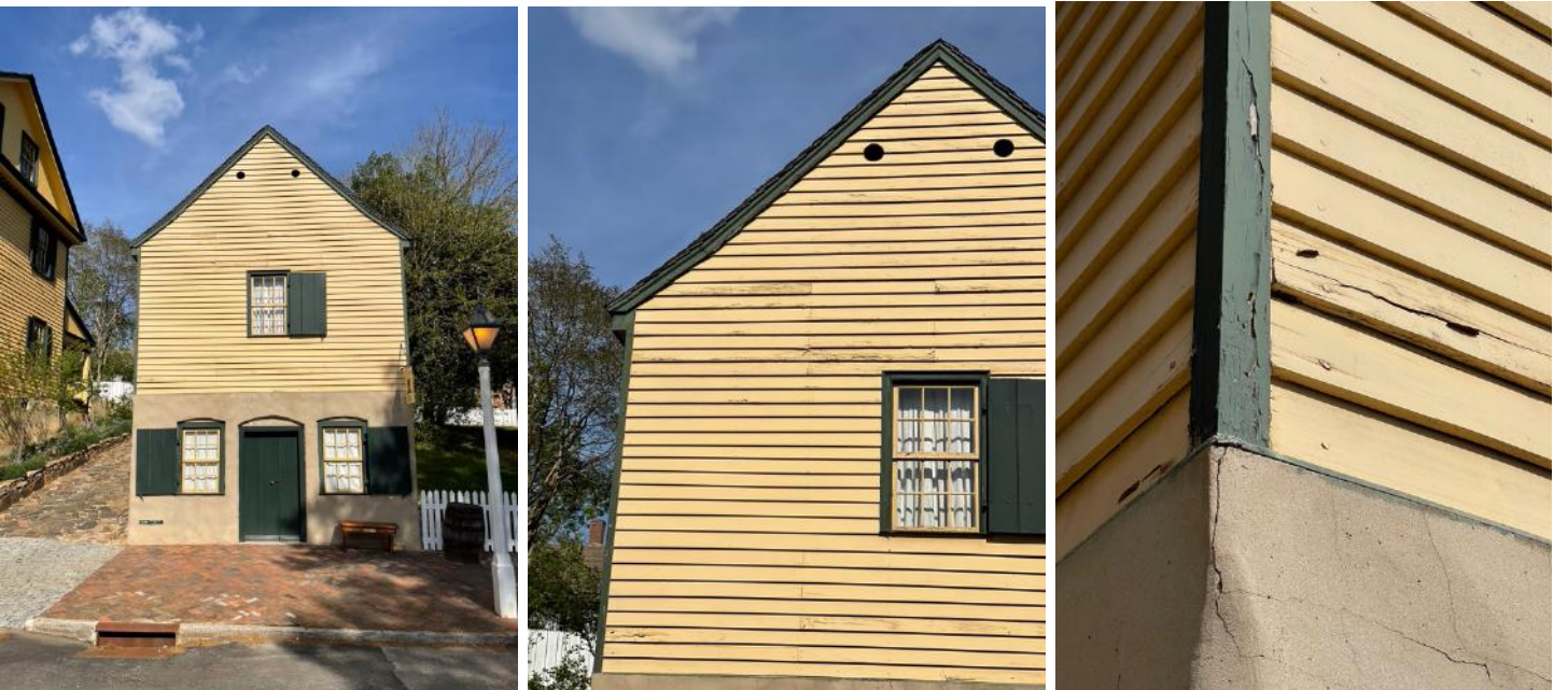
(left to right) The Hat Shop (The first jail of Salem) has minor wood repair and in need of repainting. This building will be our next Fresh Coat Initiative project.