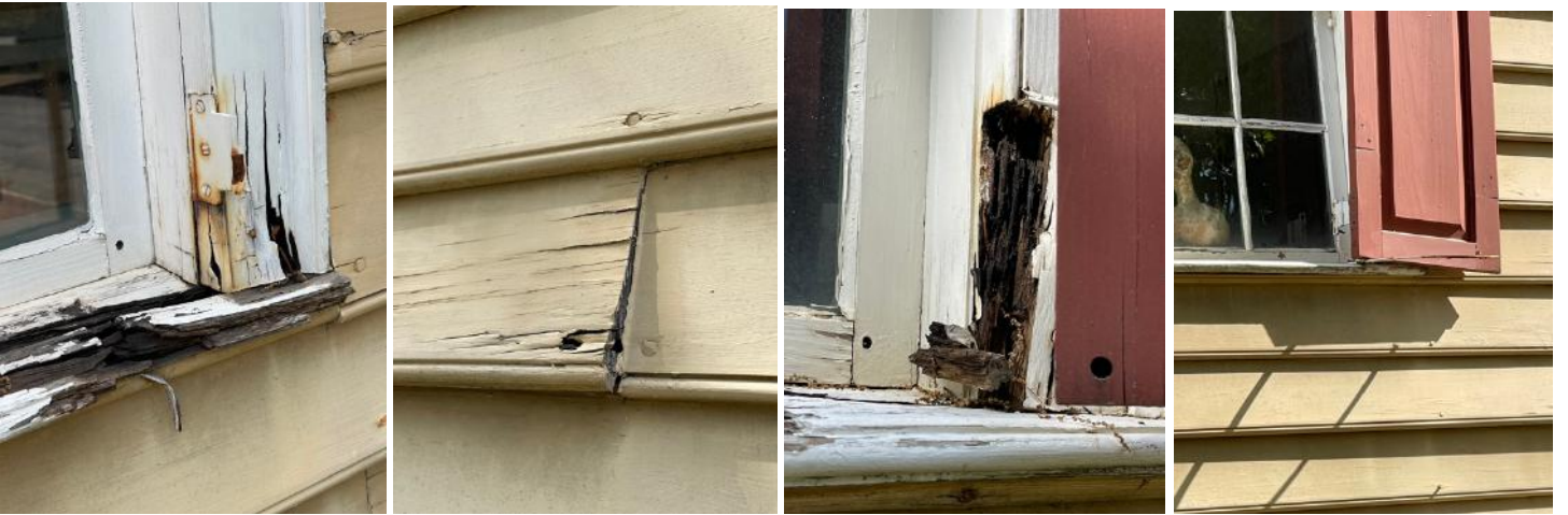
(left to right) Herbst House (Seed Saving Lab), windowsill rot, clapboard decay, shutter connection erosion, shutter failure. Restored in 2011 with minor touch-ups, this level of decline has been occurring for quite some time. Most of the damage is on the southern side, and due to the severity of the problem, we will be putting the North, South, and East sides of the building on a more intensive preservation plan. Our goal is to repair the West street front elevation and porch first to use the porch as an outdoor classroom space in the fall of 2021.