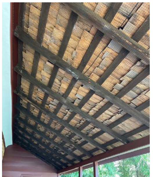
(left to right) The Back Porch of Winkler Baker, a quiet resting place for our visitors, has been long neglected because birds and critters would nest up in the wood-shake roof structure, resulting in many animal waste and bird droppings covering the surfaces below. As part of our Fresh Coat Initiative, we have installed barely visible preservation netting to keep out these animals. Now the back porch can become a clean, welcoming spot for our guests.