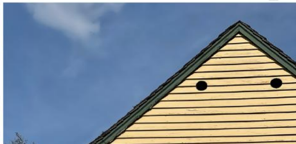
(left to right) Our next building to get attention will be the Butner Hat Shop. We have received the proposal for wood repair, prep work, and painting. This work should begin within the next two weeks. The Fresh Coat Initiative also looks at small details, like the residual holes leftover from an old MESDA sign, to be cleaned up and restored. For instance, these holes will be filled.