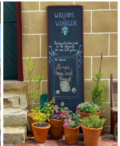
(left to right) Winkler Baker, our first venue in the historic district to re-open, received a lot of attention this past week. We added an entire bank of benches and tables to the streetscape. We wanted to allow for COVID-related precautions while still providing a welcoming environment to our guests. The horticulture crew added a dense array of potted plants around the front stoop.