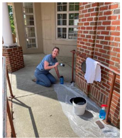
(left to right) Our "Jack of All Trades" painting week spruced up the Horton Center, Home to The Museum of Early Southern Decorative Arts. We concentrated on the chipping iron railing surrounding the entrances.