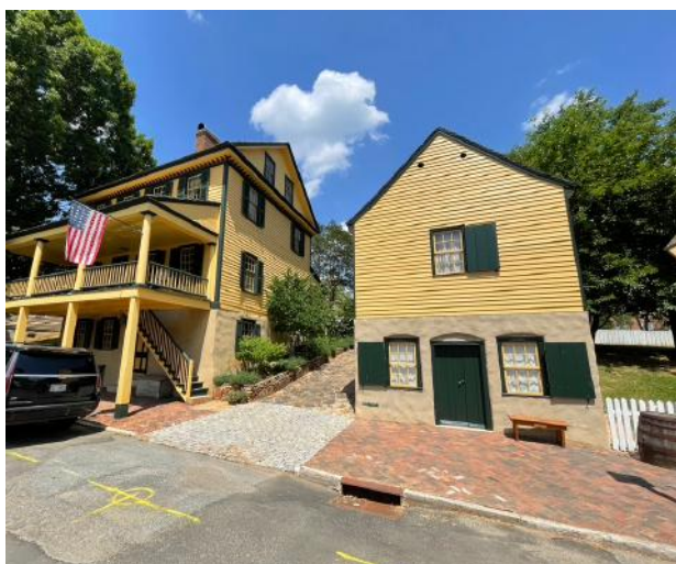
(left to right) Historic photographs show the building perhaps was not painted or only whitewashed; the color of the building now matches the private residence of the Butner House.