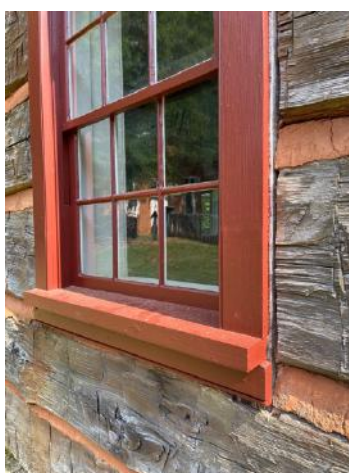
(left to right) Our Fresh Coat Initiative work includes the wood window repair and painting of the St. Phillips Log Church. As a fully reconstructed building, the material selection and replacement involve less restrictive parameters. Just as in the Butner Shop building, the selective wood replacement at the log church requires attention in the appearance of the location and type of nails. We are considering the repair of the “chinking” to become a public-facing preservation workshop. Thank you to Tony Bragg, Facilities Team, for his work on the window repair and painting.