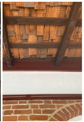
(left to right) The back porch of the historic Winkler Bakery had a problem with bird waste and squirrels nesting in the exposed ceiling & wood shake roof. Preservation netting has been fully installed, and now the entire porch has been power-washed to provide a clean spot to enjoy Winkler treats. Thank you to our Preservation team for completing this effort.