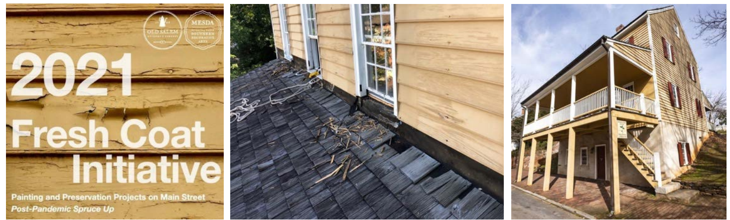
(Left to right) The Herbst House restoration and repair has a long list of needs. The most urgent needs are found on the Main Street façade. Visitors use the porch and sidewalk stairs to access the new SEED SAVING LAB, so these repairs are essential to ensure a good quality experience. The windowsills, bottom clapboard, and roof shakes all needed full replacement before re-painting could occur.