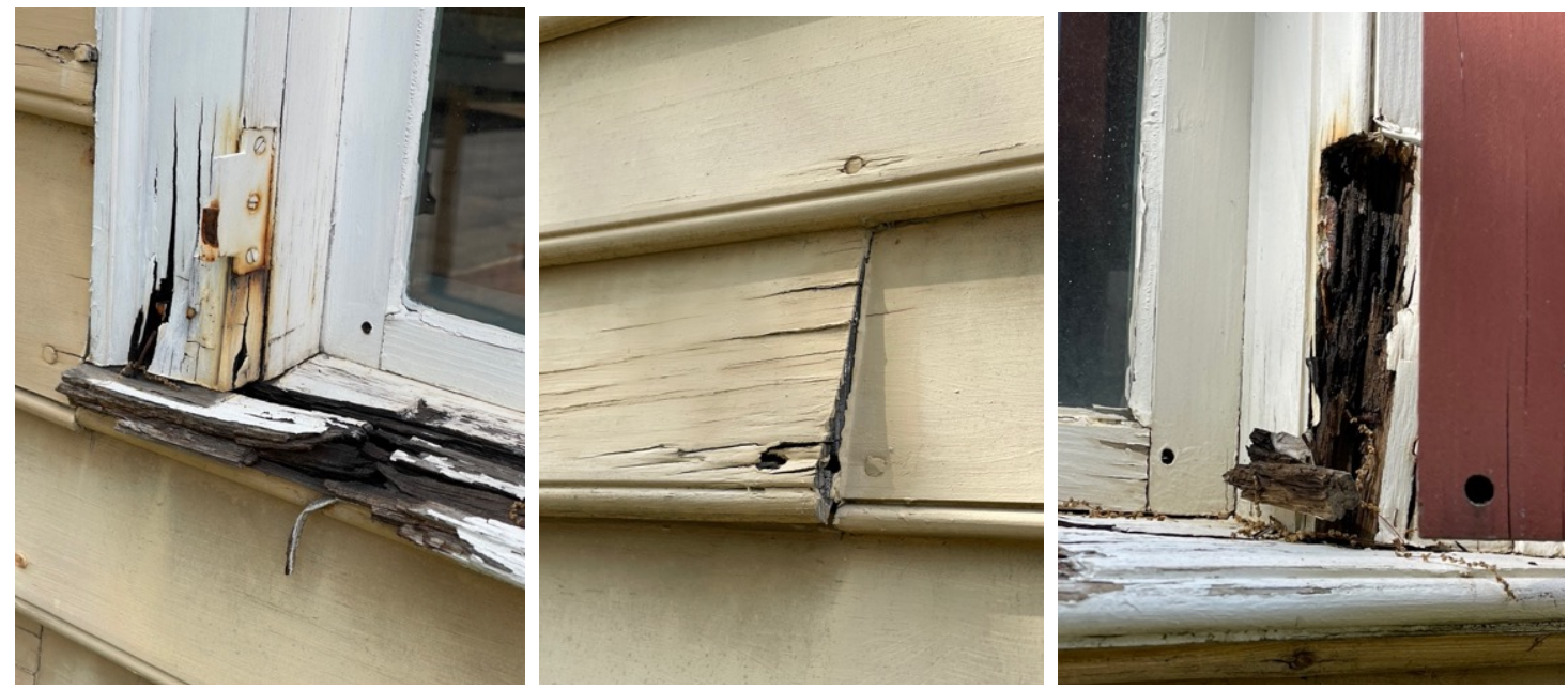
(Left to right) The exterior wood sheathing and window frames needed some level of repair or replacement. The sills had become so rotten that the shutter hinges had fallen free from the screws and the shutters were poorly attached. As you can see from these photographs, the repairs needed to take place before any Fresh Coat Initiative painting could be done.